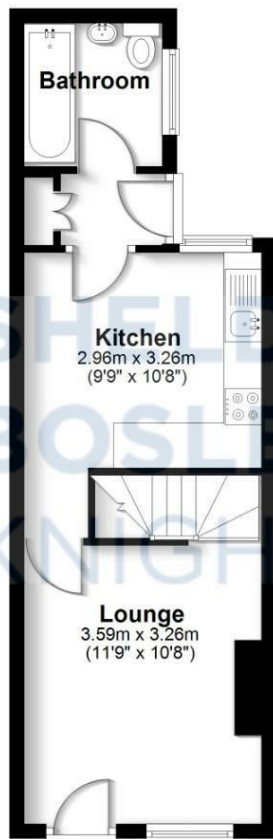
Ground Floor Approx. 30.4 sq. metres (327.7 sq. feet)